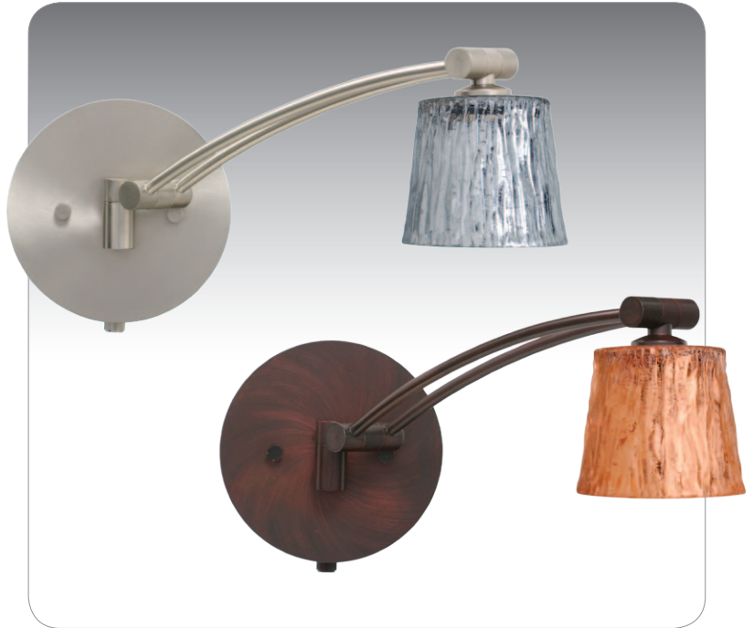
NICO 3 SWING ARM SHOWN IN "WW" STONE SILVER FOIL (1WW-5145SFSN) & "WW" STONE COPPER FOIL (1WW-5145CF-BR) IN BRONZE FINISH

UL or ETL Listed. Suitable for Damp Locations (interior use only).