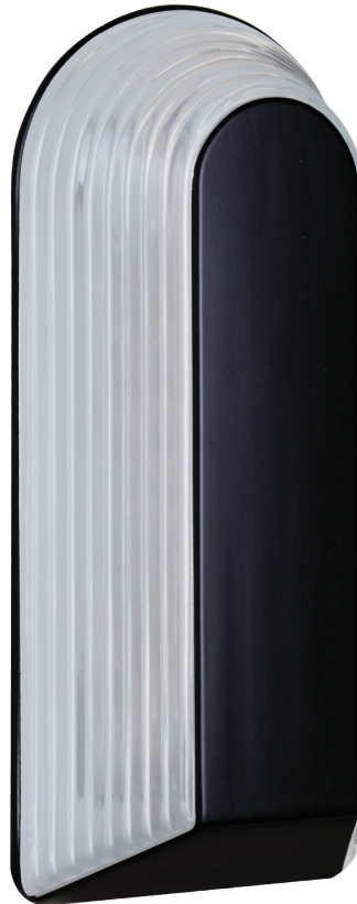
243357-FR Black with Frost option