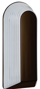
243398-FR Bronze with Frost option