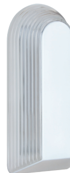
243353-FR White with Frost option