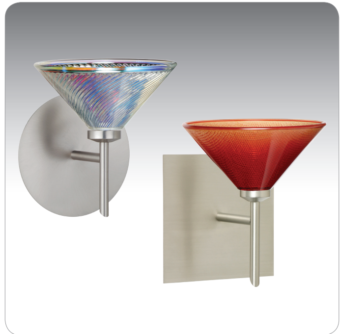
KONA SHOWN IN DICRO SWIRL (550493) & SUNSET (117681) WITH SQUARE CANOPY

UL or ETL Listed. Suitable for Damp Locations (interior use only).