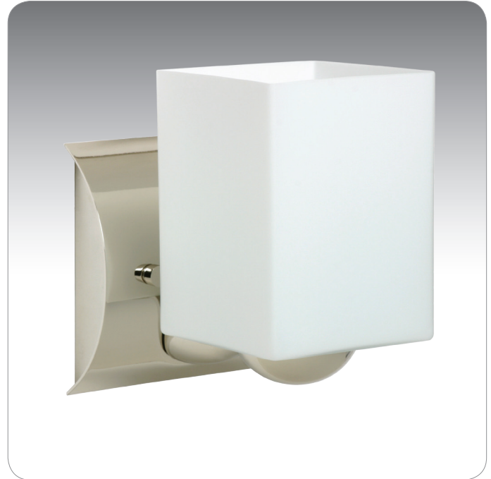
RISE SHOWN IN OPAL MATTE (449807)

UL or ETL Listed. Suitable for Damp Locations (interior use only).