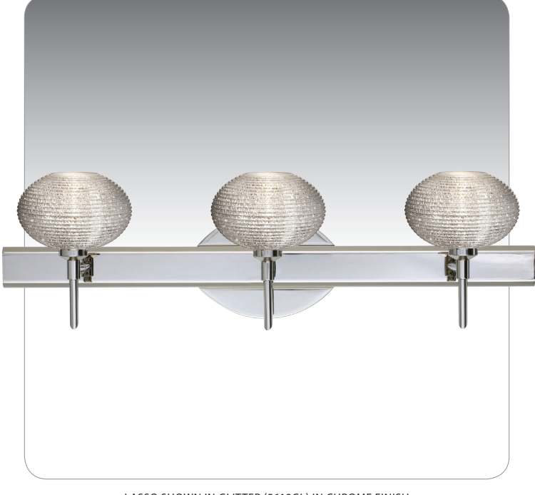
LASSO SHOWN IN GLITTER (5612GL) IN CHROME FINISH

UL or ETL Listed. Suitable for Damp Locations (interior use only).