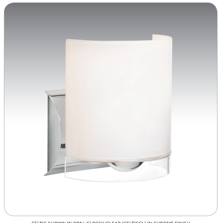
CELTIC SHOWN IN OPAL GLOSSY/CLEAR (CELTICCL) IN CHROME FINISH