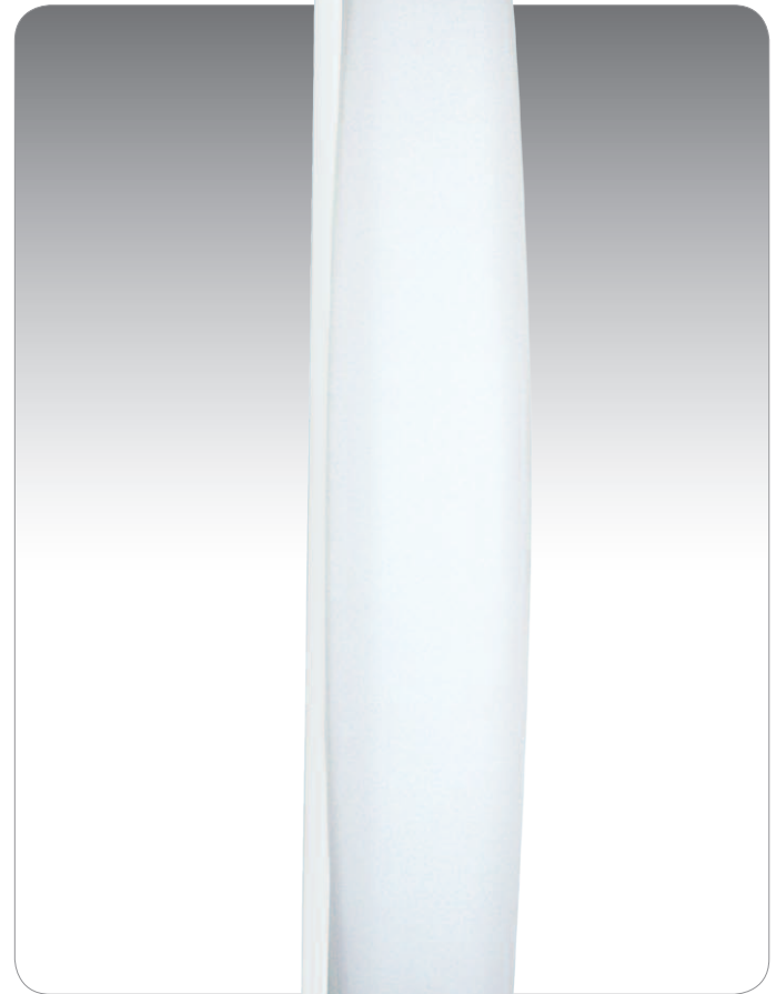
MIRANDA 26 SHOWN IN SATIN WHITE (MIRANDA26-SW)