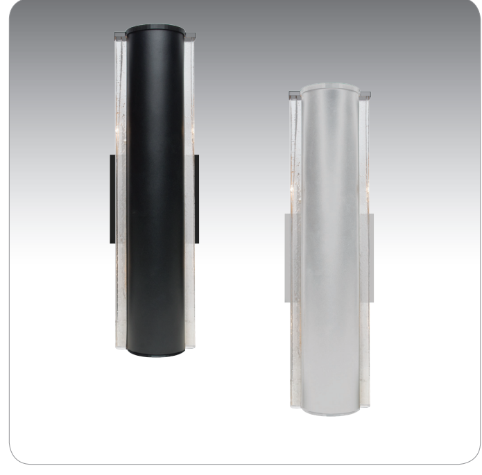
SHOWN IN BLACK/CLEAR BUBBLE AND SILVER/CLEAR BUBBLE