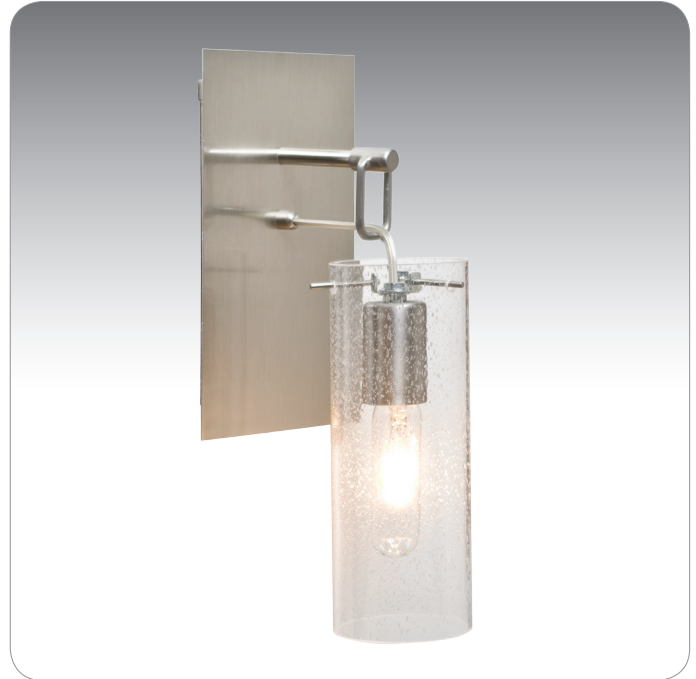
CLEAR BUBBLE (JUNI10CL)

UL or ETL Listed. Suitable for Damp Locations (interior use only).