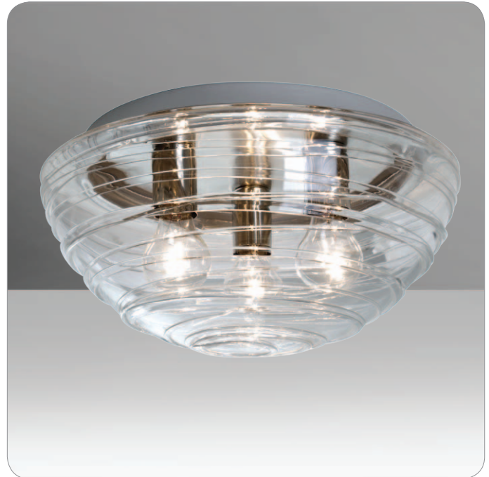
WAVE 15 CEILING SHOWN IN CLEAR (906361C)

UL or ETL Listed. Suitable for Damp Locations (interior use only).