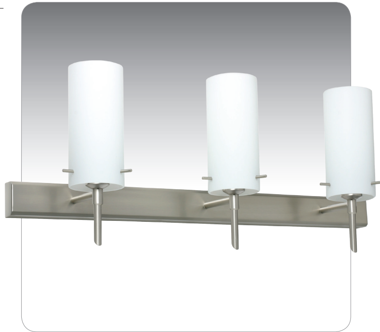
COPA 3 SHOWN IN OPAL MATTE (440307) WITH NO CANOPY

UL or ETL Listed. Suitable for Damp Locations (interior use only).